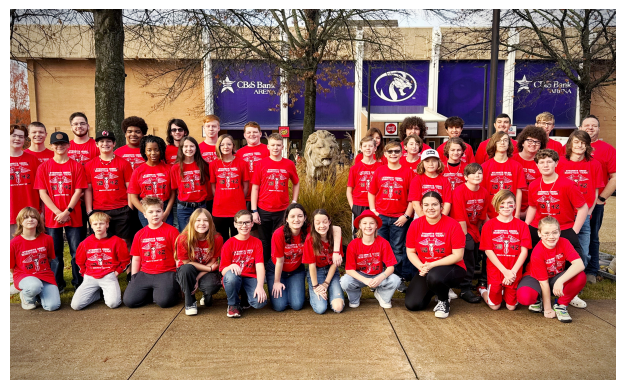
2023 South's BEST Finals at University of North Alabama