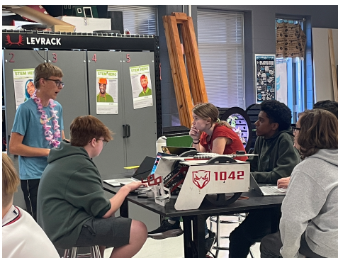
Programmers helping students from another team

The SC Robotics Team was founded in 2015 as part of the Stewarts Creek Middle School STEM program. With only a few hand tools, a couple of computers, and can-do attitudes, our team competed in the national BEST Robotics competition at Lipscomb University in Nashville Tennessee. Three years later, this team of talented students won that competition's first place BEST award and is now the 5th highest ranked BEST team in the nation.